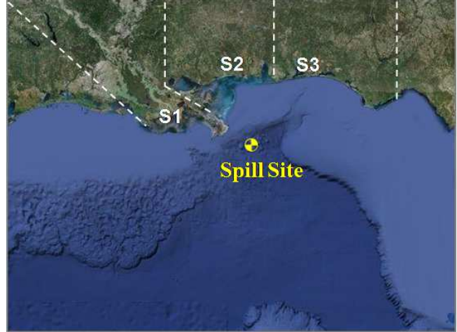
Figure 1: Oil spill site and locations of the three staging areas for the case study